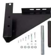
MINI DOOR EXTENSION KIT