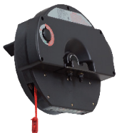
IP24 Weather Resistant Operator