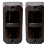
3 - Wire Safety Beams